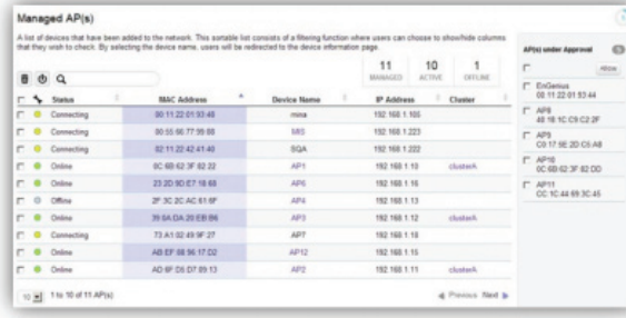
Managed AP(s) List: Easily install, configure, manage and monitor all APs in network